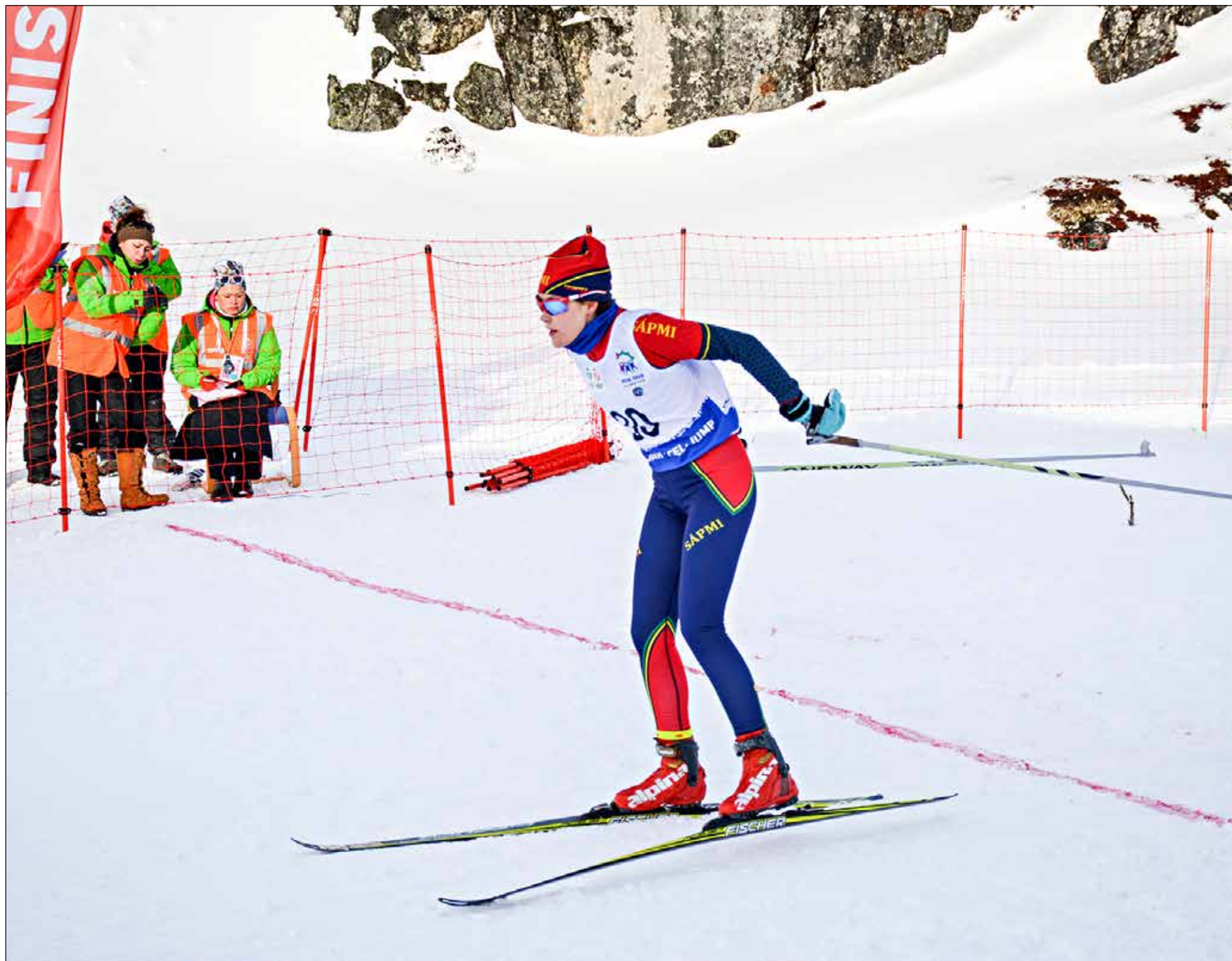
2016 Arctic Winter Games photo