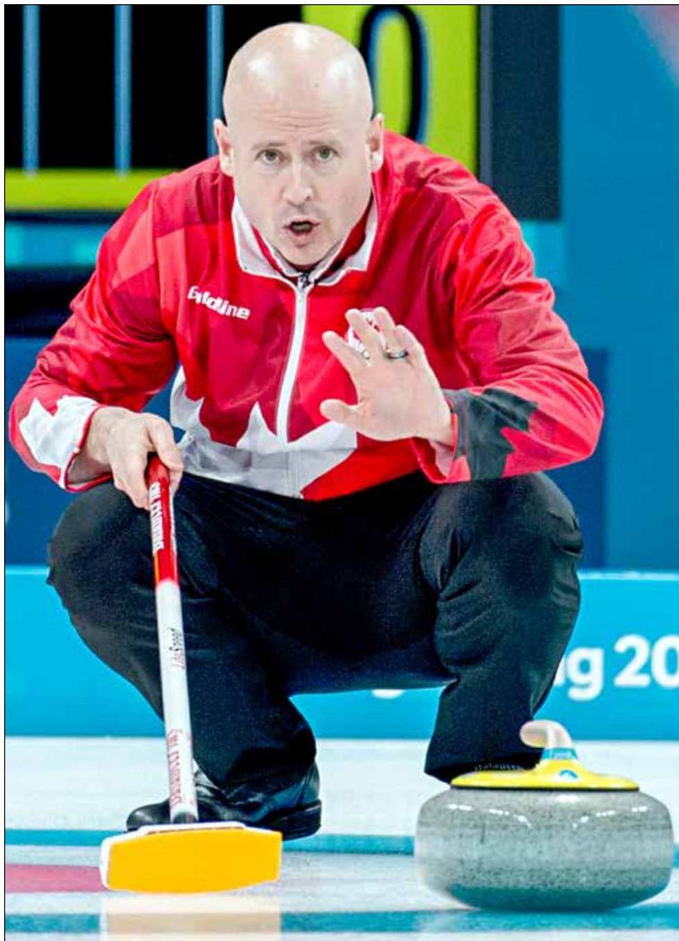
Kevin Koe calls the line during men's curling action at the 2018 Winter Olympics in PyeongChang, South Korea last month. Koe's road to the Winter Olympics featured two appearances at the Arctic Winter Games in 1992 and 1994