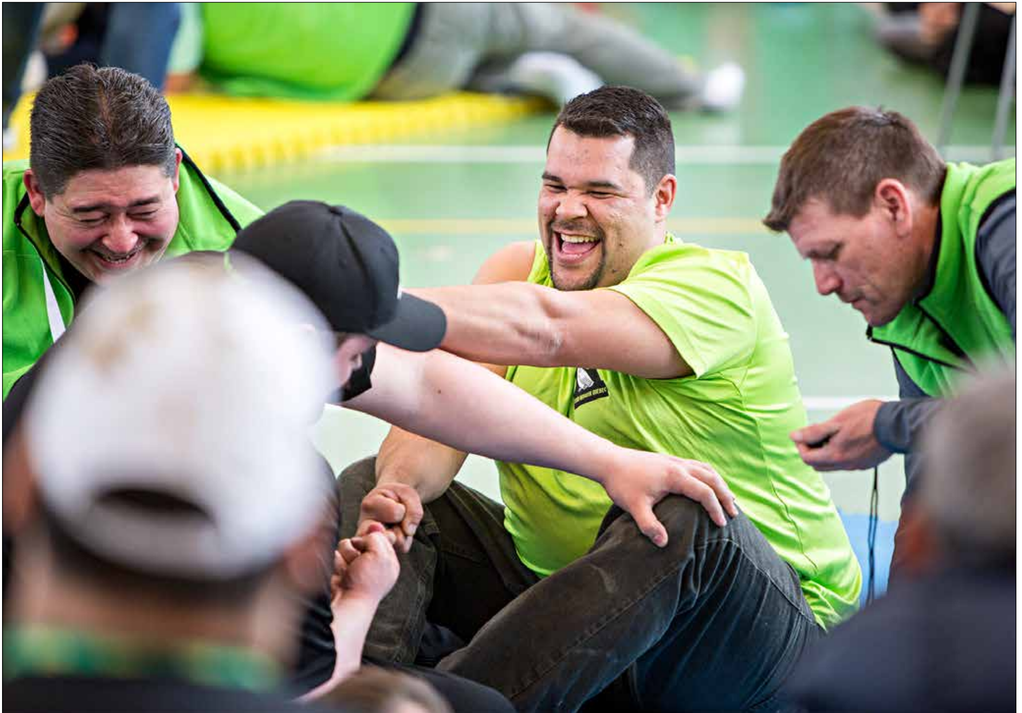
2016 Arctic Winter Games photo